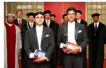
PhD graduation ceremony