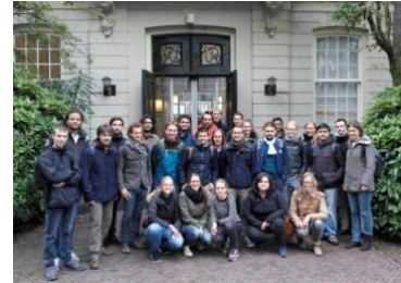
The NETWORKS PhD students

The NETWORKS project is a collaboration of world-leading researchers from four institutions in The Netherlands – TU Eindhoven , University of Amsterdam , Leiden University and the Centrum Wiskunde & Informatica (CWI) – focusing on the stochastics and algorithmics behind network problems. It offers a highly stimulating research environment and an extensive training program for PhD students from all over the world. Recently NETWORKS was awarded a COFUND grant from the Marie Skłodowska-Curie Actions (MSCA), funded by the European Commission. The grant allows NETWORKS to expand its activities by opening positions for an additional 14 international PhD students.