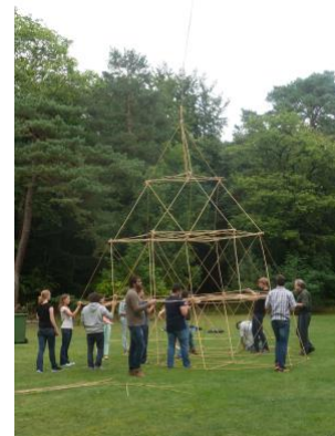
Community building event

Training Weeks. NETWORKS organizes two Training Weeks per year. The morning sessions in each Training Week are devoted to two mini-courses , one on a topic from stochastics and the other on a topic from algorithmics. The afternoon sessions feature research presentations by NETWORKS researchers (PIs or other staff members, postdocs and PhD students) about their current work, and working sessions where participants can collaborate on research problems. The Training Weeks are held at off-campus locations, to maximize social interaction and community building among the NETWORKS researchers.