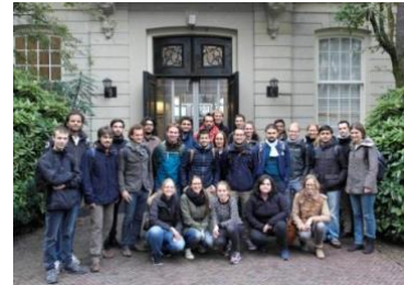
The NETWORKS PhD students

The NETWORKS project is a collaboration of world-leading researchers from four institutions in The Netherlands – TU Eindhoven , University of Amsterdam , Leiden University and the Centrum Wiskunde & Informatica (CWI) – focusing on the stochastics and algorithmics behind network problems. It offers a highly stimulating research environment and an extensive training program for PhD students from all over the world. Recently NETWORKS was awarded a COFUND grant from the Marie Skłodowska-Curie Actions (MSCA), funded by the European Commission. The grant allows NETWORKS to expand its activities by opening positions for an additional 14 international PhD students.