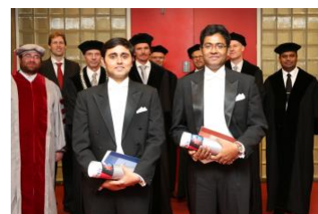
PhD graduation ceremony

The research and training program of NETWORKS offers you excellent opportunities for a future career, be it in academia, government, or industry. NETWORKS graduates found jobs at top academic institutions both in and outside Europe (including MIT, Georgia Tech, Warwick University, and Max-Planck-Institut für Informatik), at major multinationals in the high-tech and financial industry (including Microsoft, Google, PriceWaterhouseCoopers and ABN-AMRO) and at medium-size companies and start-ups.