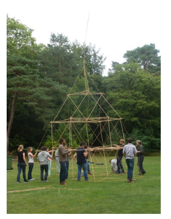
Community building event

Training Weeks . NETWORKS organizes two Training Weeks per year. Each Training Week comprises two mini-courses , one on a topic from stochastics and the other on a topic from algorithmics. Next to the mini courses there are research presentations by NETWORKS researchers (PIs or other staff members, postdocs and PhD students) about their current work, and working sessions where participants can collaborate on research problems. The Training Weeks are held at off-campus locations, to maximize social interaction and community building among the NETWORKS researchers.